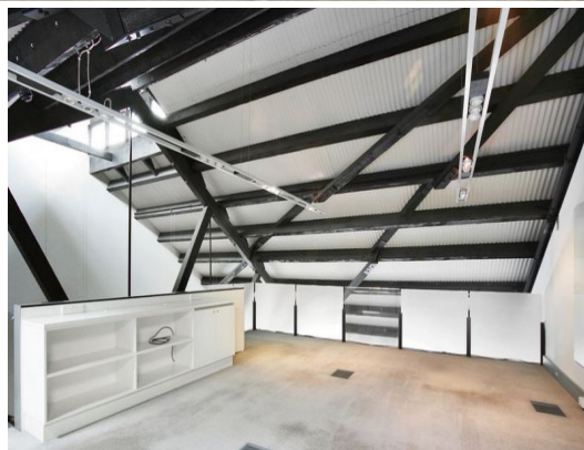
55/26-32 Pirrama Road, PYRMONT