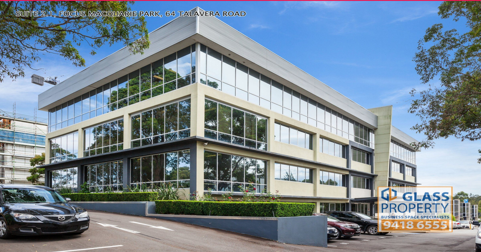
SUITE 2.1, FOCUS MACQUARIE PARK, 64 TALavera ROAD