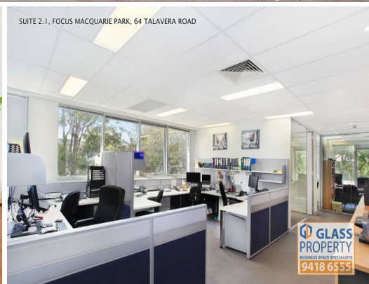
Suite 2.1/64 Talavera Road, NORTH RYDE