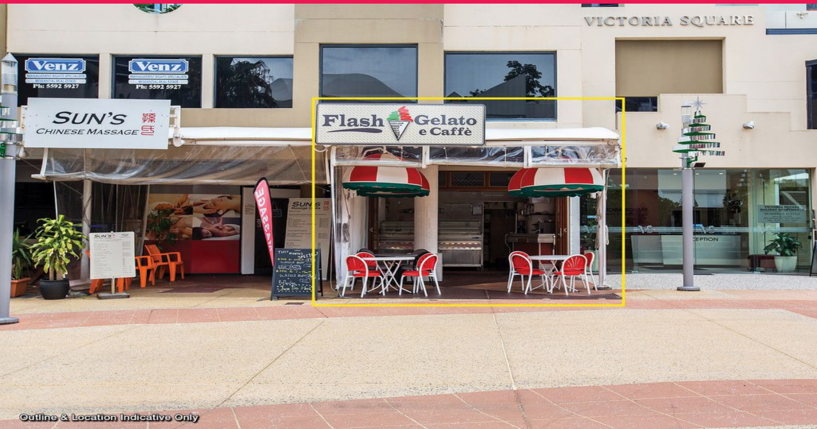
Outline & Location Indicative Only