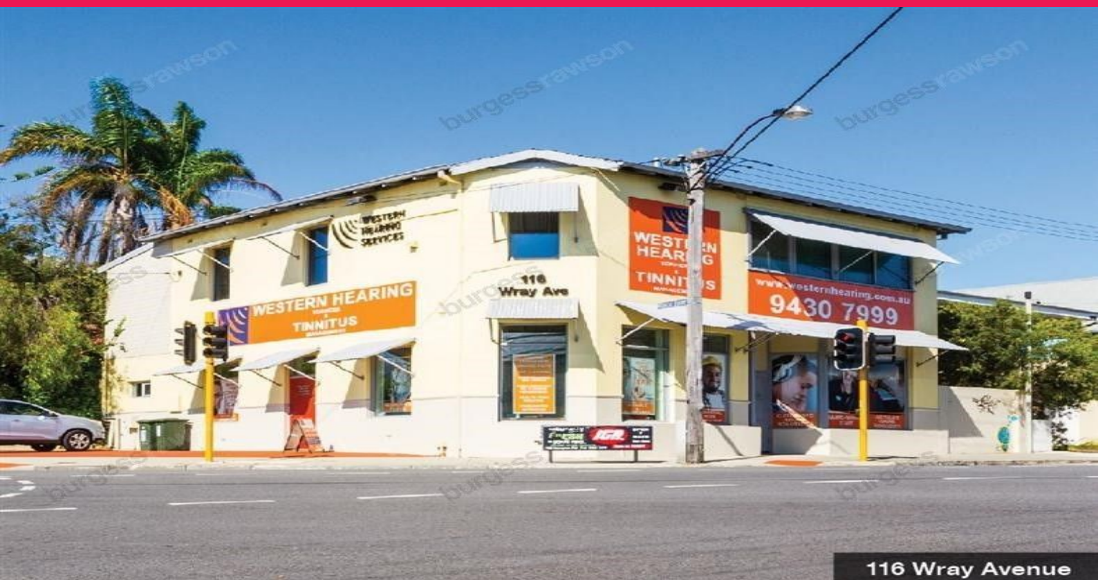
116 Wray Avenue