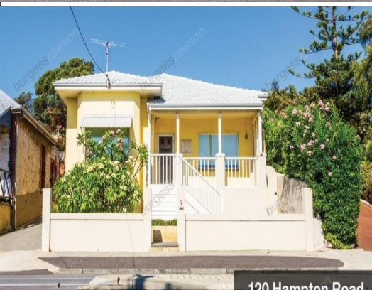
120 Hampton Road