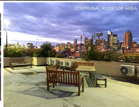
COMMUNAL ROOFTOP AREA

Unit 2121/185-211 Broadway, Broadway NSW 2007