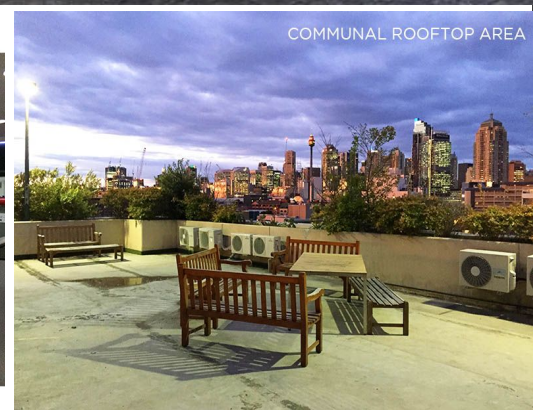
COMMUNAL ROOFTOP AREA

Unit 2121/185-211 Broadway, Broadway NSW 2007