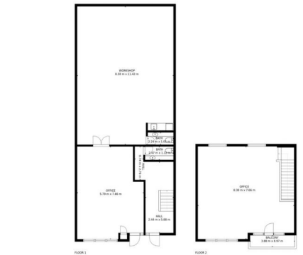
53/28 Burnside Road Ormeau, QLD, Australia