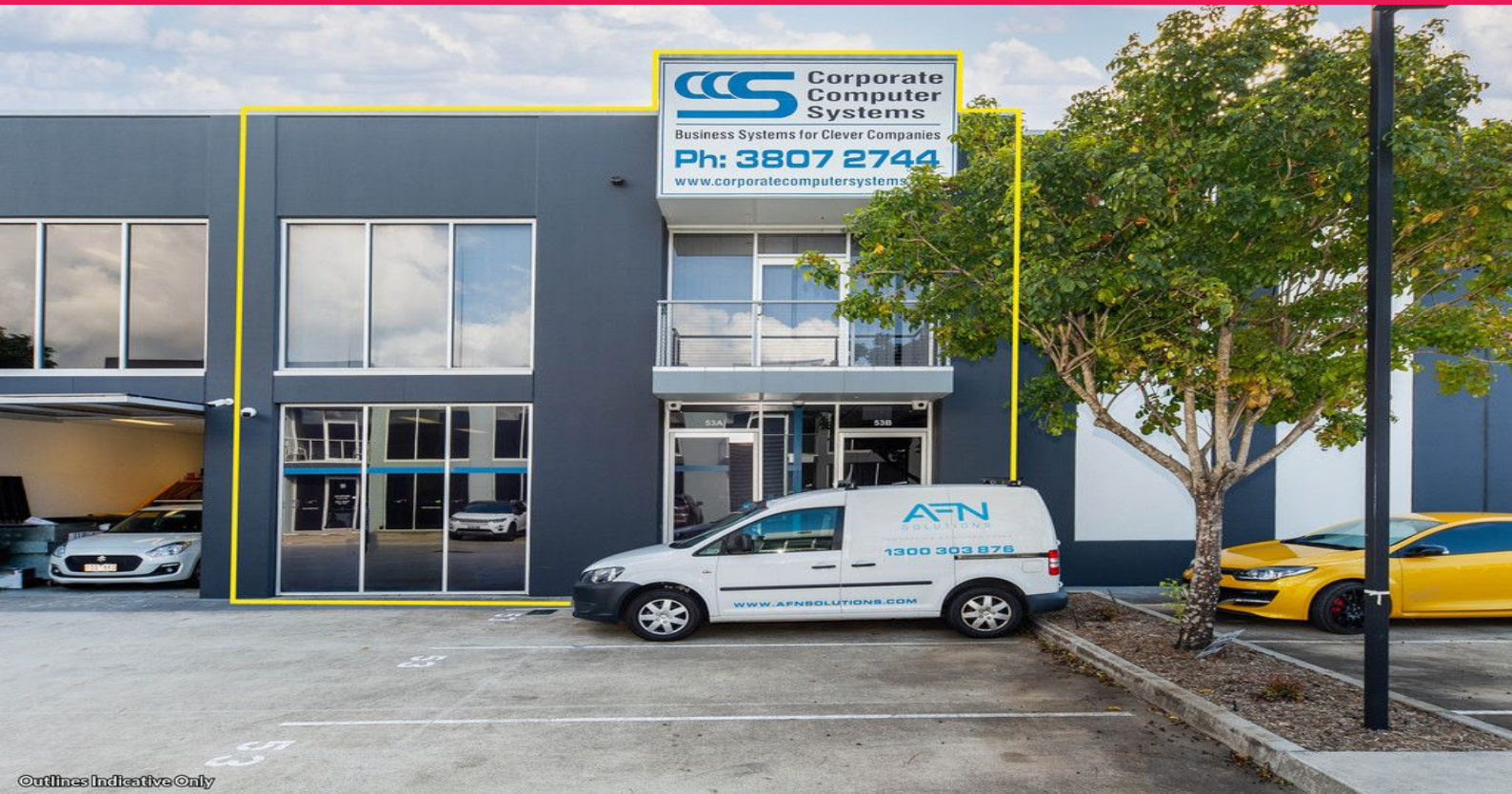
Outlines Indicative Only