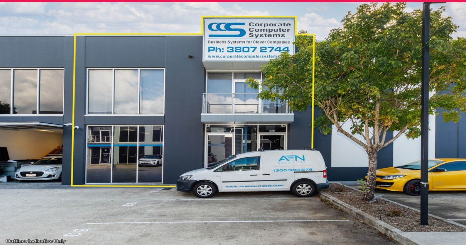
Outlines Indicative Only