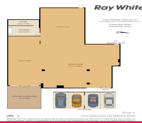
Swite 1 5/ 200 Maroubra Road, Maroubra Junction NSW