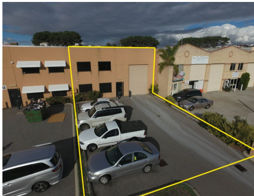
24b Bowen Street, O'Connor