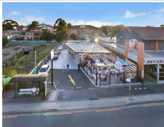
437-441 King Georges Road, BEVERLY HILLS