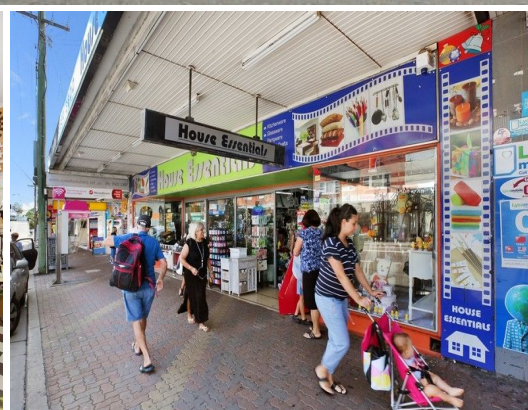
264 Kingsgrove Road, KINGSGROVE