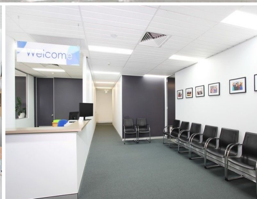
Level 1 / 12 Butler Road, HURSTVILLE