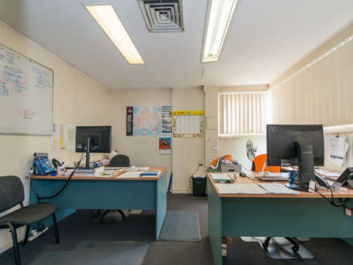
14-18 Avro Street, Tamworth NSW 2340