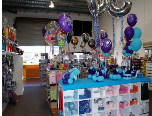
Unit 2, 6-8 Amber Drive, Tweed Heads South NSW 2486