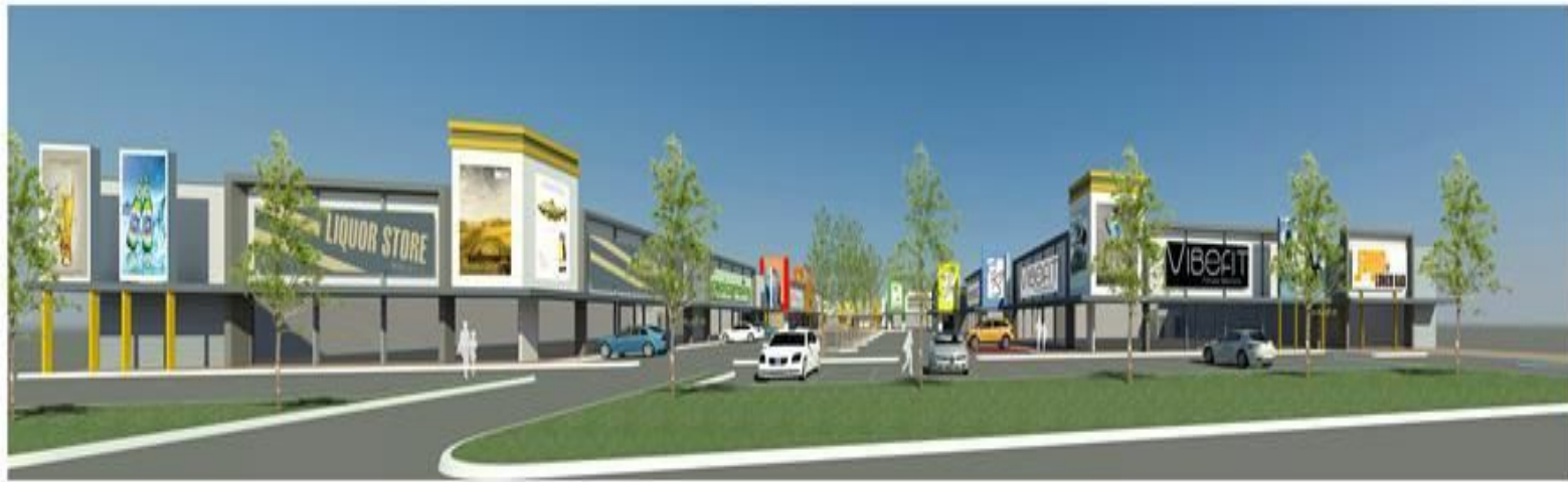
VIEW FROM FAIRBROTHER STREET