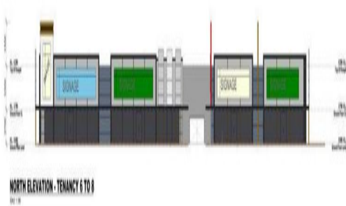
NORTH ELEVATION - TENANCY 5 TO 8 02/18