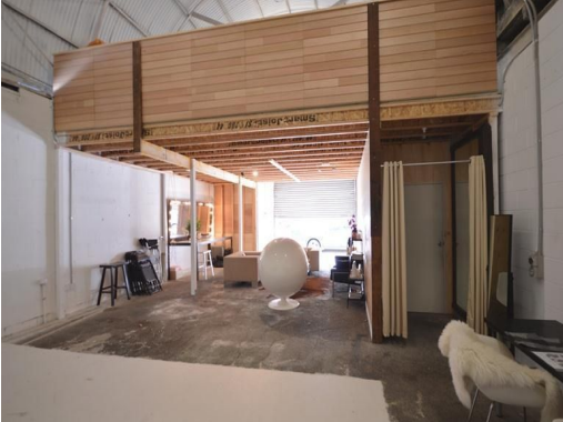
Lot 17&20/20 Greenway Street, Wickham NSW 2293