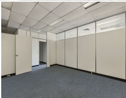
5/1016 Doncaster Road DONCASTER EAST