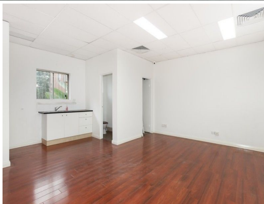
157 Princes Highway, ARNCLIFFE