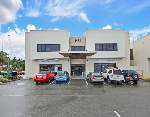
8/1151 Wynnum Road, Cannon Hill QLD 4170