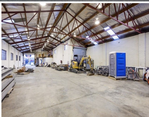
7 Production Avenue, KOGARAH