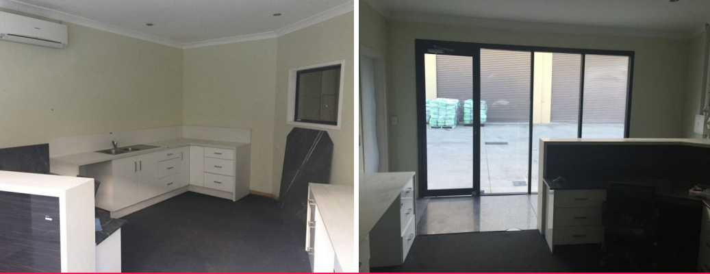
Unit 9/31 Lundberg Drive, Murwillumbah NSW 2484