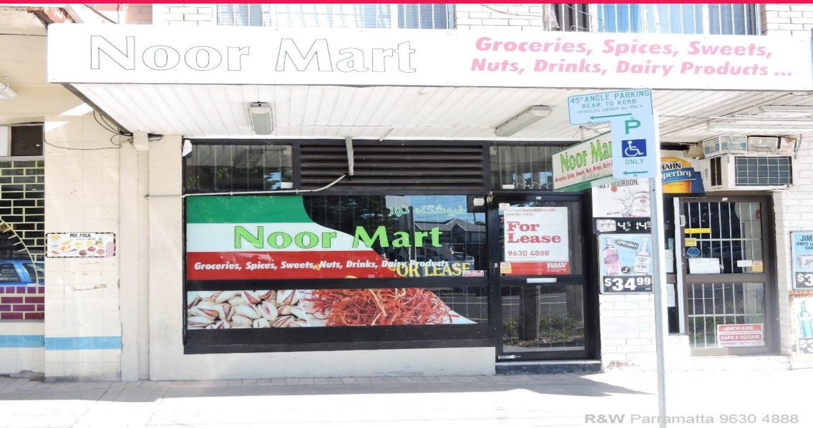
R&W Parramatta 9630 4888