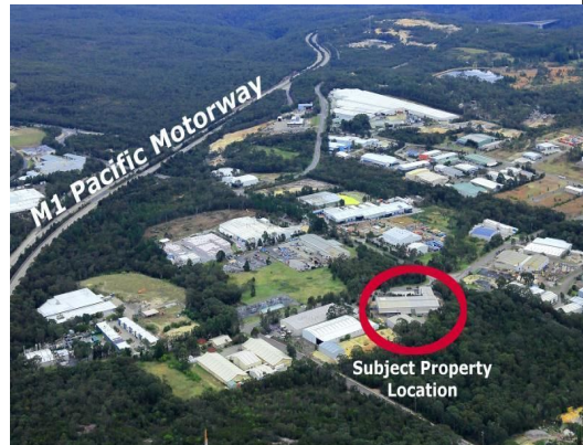
Subject Property Location