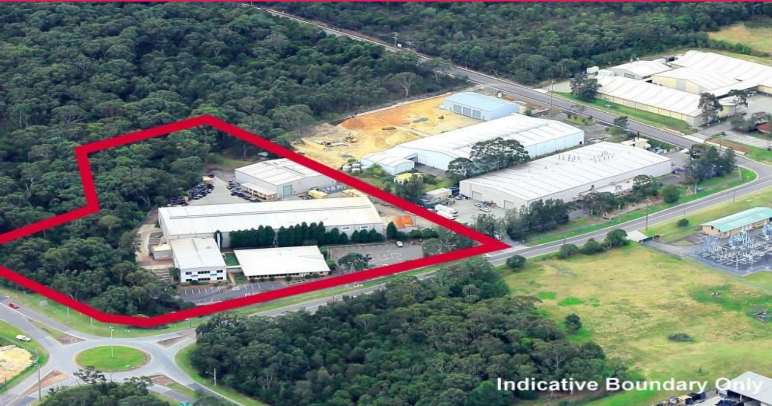
Indicative Boundary Only