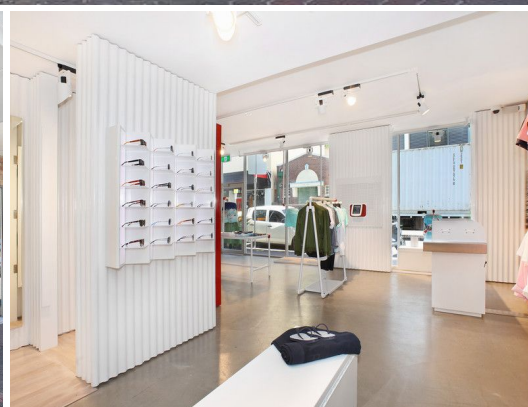
1/79 Gould Street, BONDI BEACH