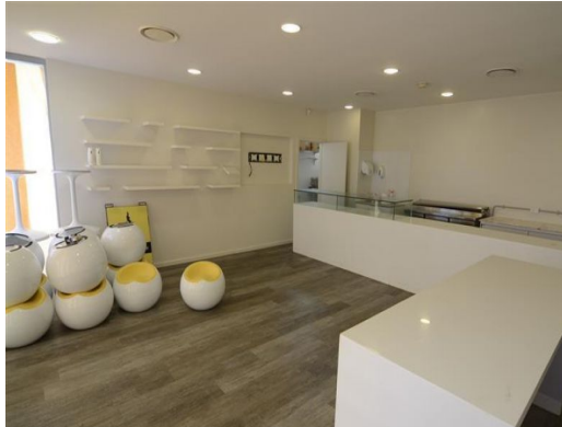
Shop 3a/5 Honeysuckle Drive, Newcastle NSW 2300