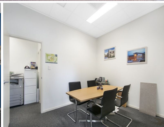
160 Mudjimba Beach Road, MUDJIMBA