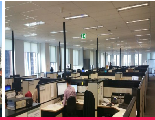
Level 7/80 Pacific Highway, North Sydney NSW 2060