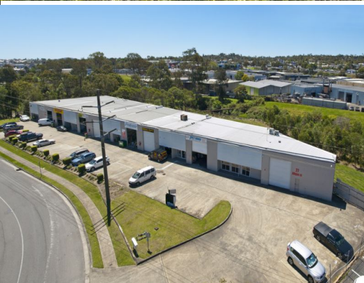
COMMERCIAL UNIT & OFFICE Unit 8, 27 Allgas street, Slacks Creek QLD 4207