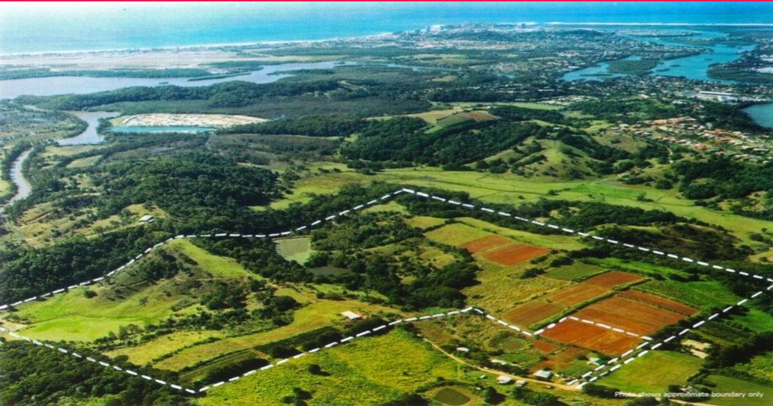
Photo shows approximate boundary only