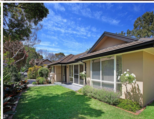
29 Saunders Bay Road, CARINGBAH