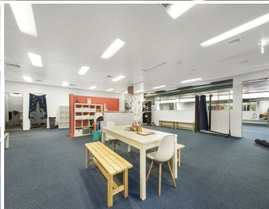
LEVEL 1, C & D/ 501-509 HIGH STREET, PRESTON