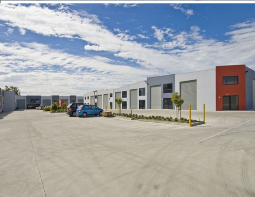
UNIT 18 - 139m2