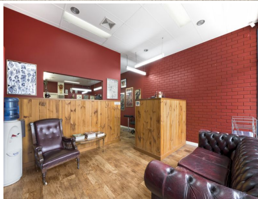
12 MARKET STREET, NUNAWADING