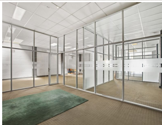
308-310 SYDNEY ROAD, COBURG