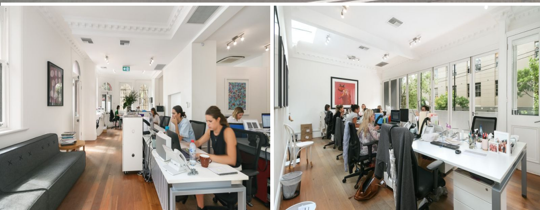
263 - 265 Riley Street, SURRY HILLS