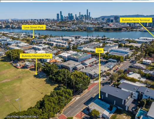
LOCATIONS INDICATIVE ONLY