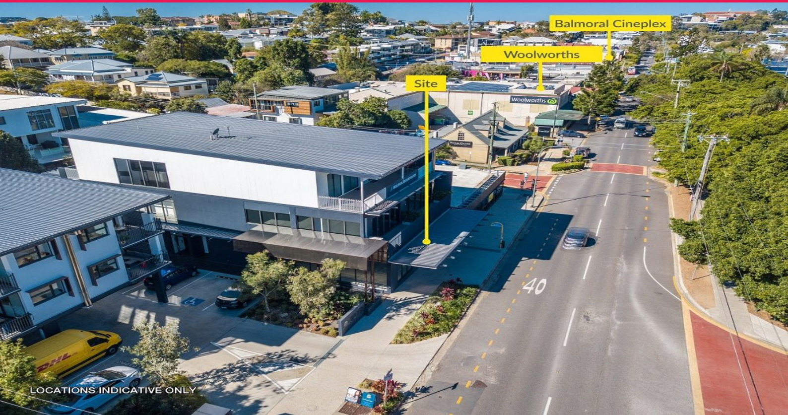
LOCATIONS INDICATIVE ONLY