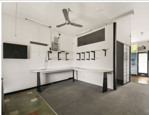
6 HUNTER DRIVE, BLACKBURN SOUTH