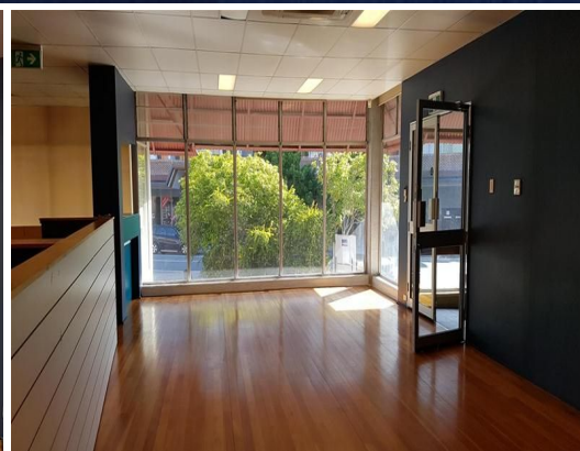
314 Montague Road, WEST END