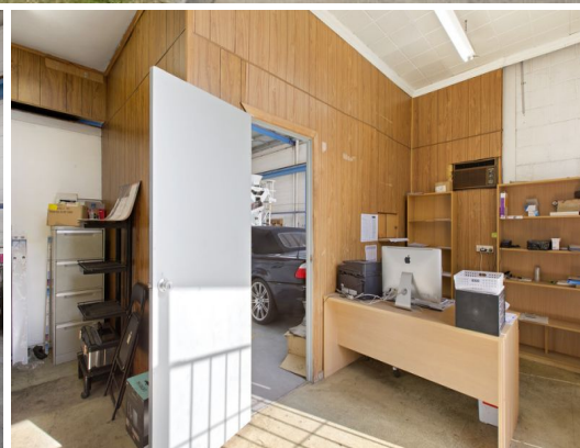
1/9 MACRO COURT, ROWVILLE