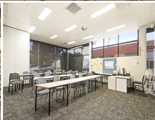
A-126 SPRINGVALE ROAD, SPRINGVALE