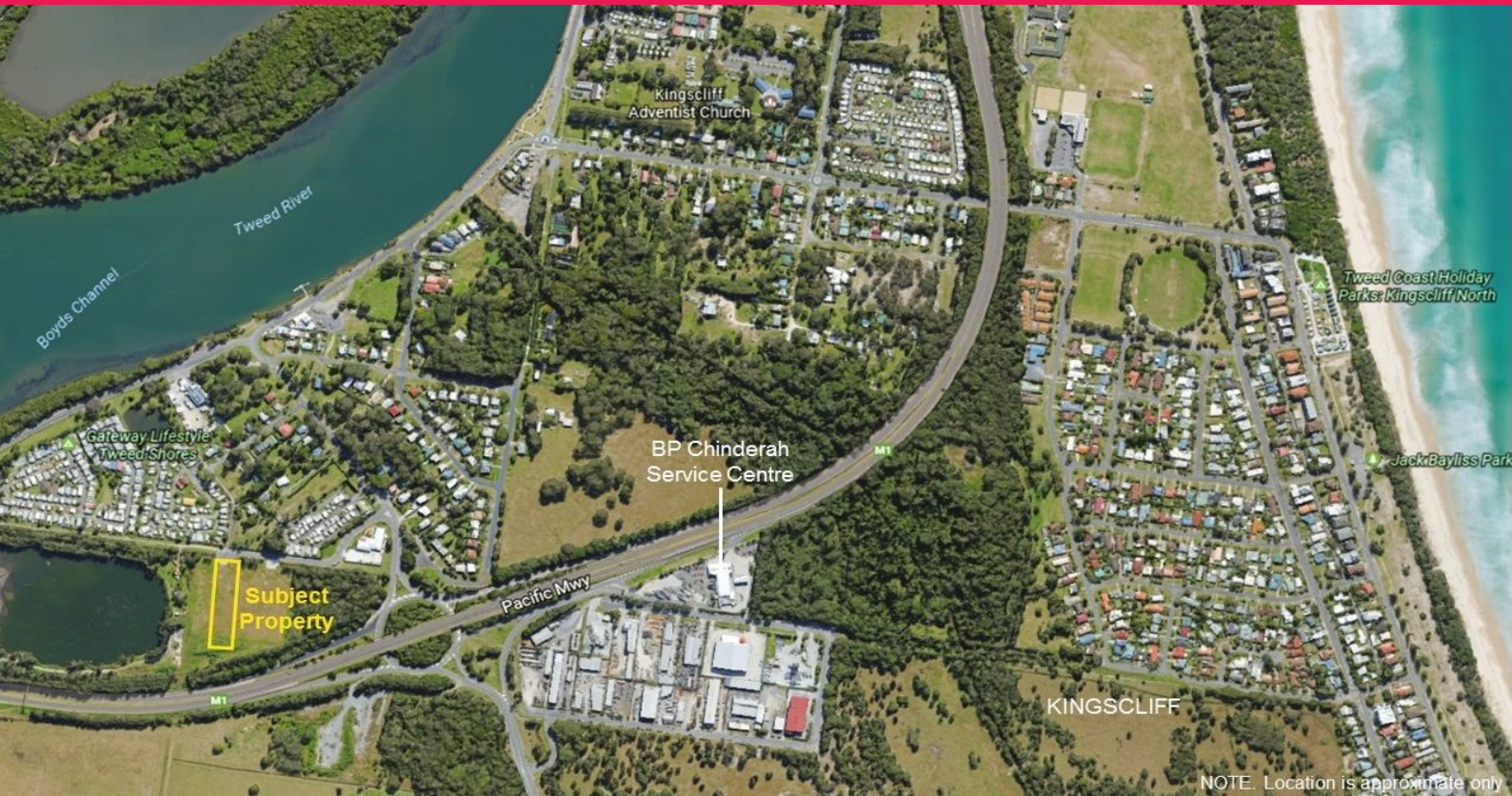
NOTE: Location is approximate only