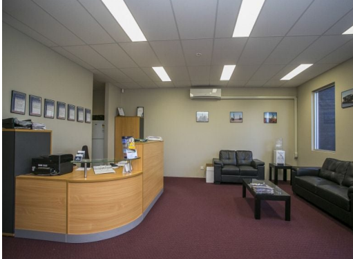
Unit 2 / 52 Erceg Way, Yangebup WA 6164