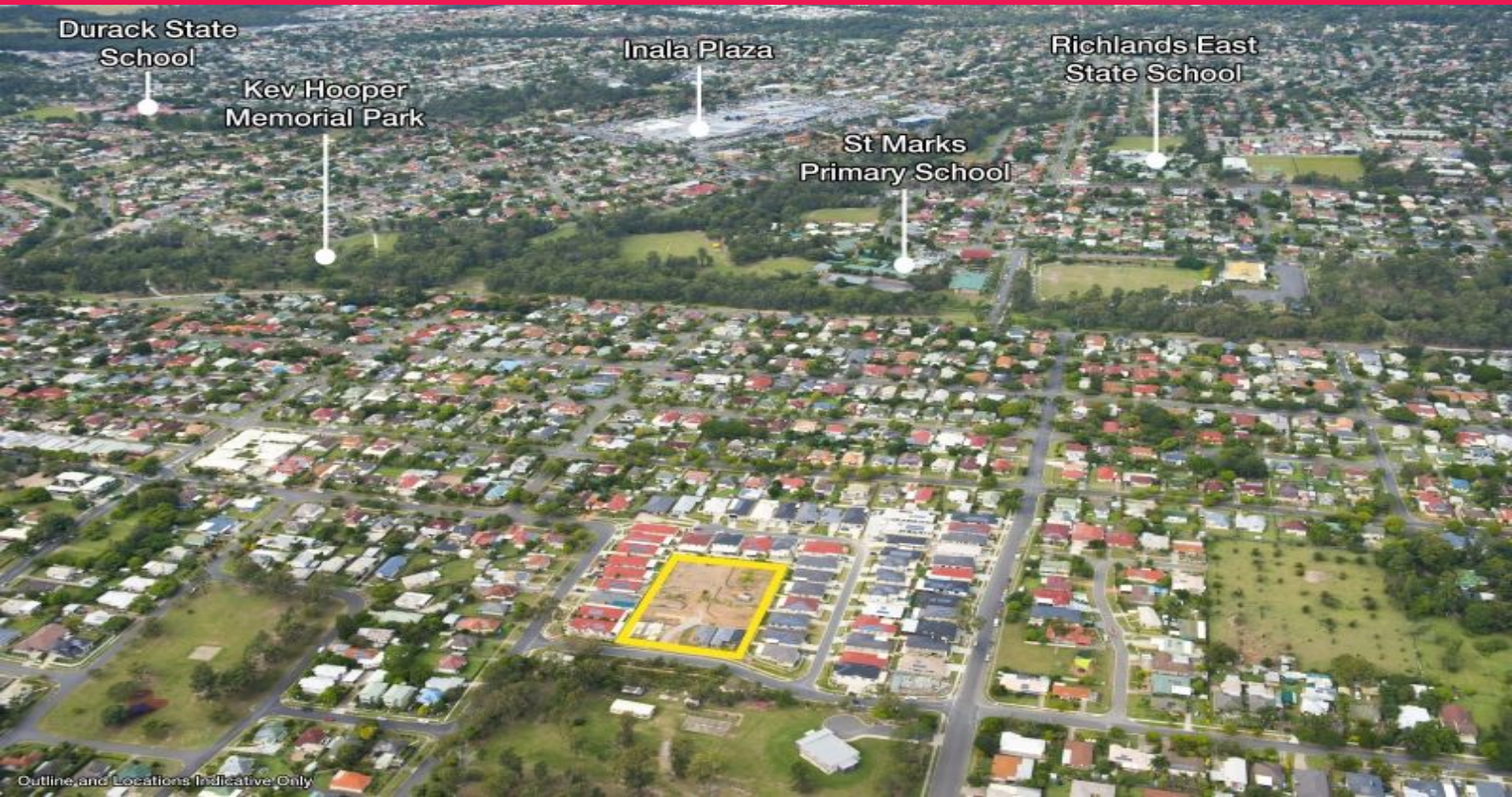
Outline and Locations Indicative Only