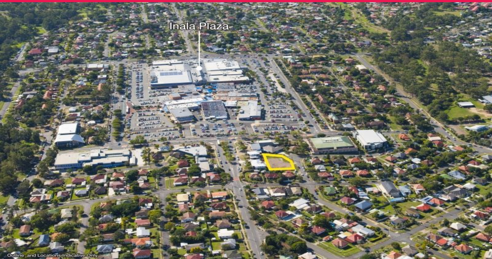
Outline and Locations Indicative Only