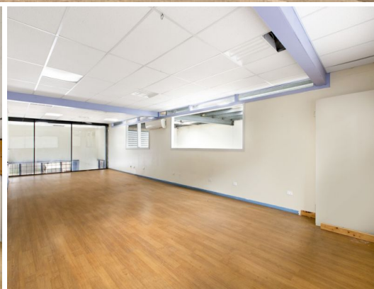
17/5 SAMANTHA COURT, KNOXFIELD