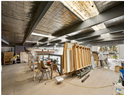
1/1861 FERNTREE GULLY ROAD, FERNTREE GULLY