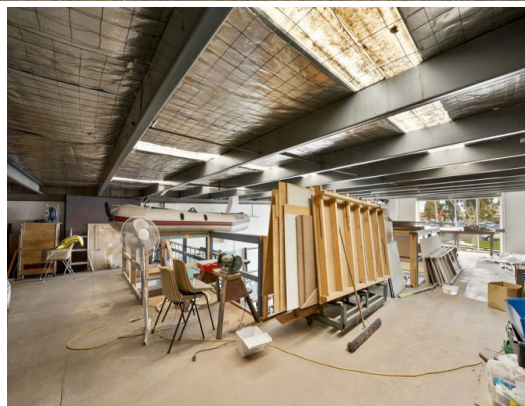
1/1861 FERNTREE GULLY ROAD, FERNTREE GULLY