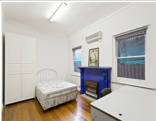
627 CAMBERWELL ROAD, CAMBERWELL