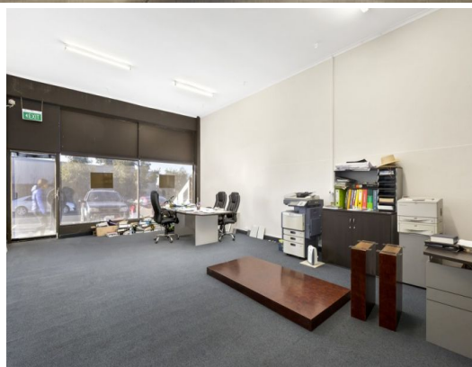
25 ROSELLA STREET, DONCASTER EAST