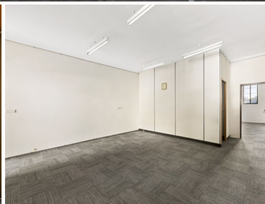
29 WORRELL STREET, NUNAWADING