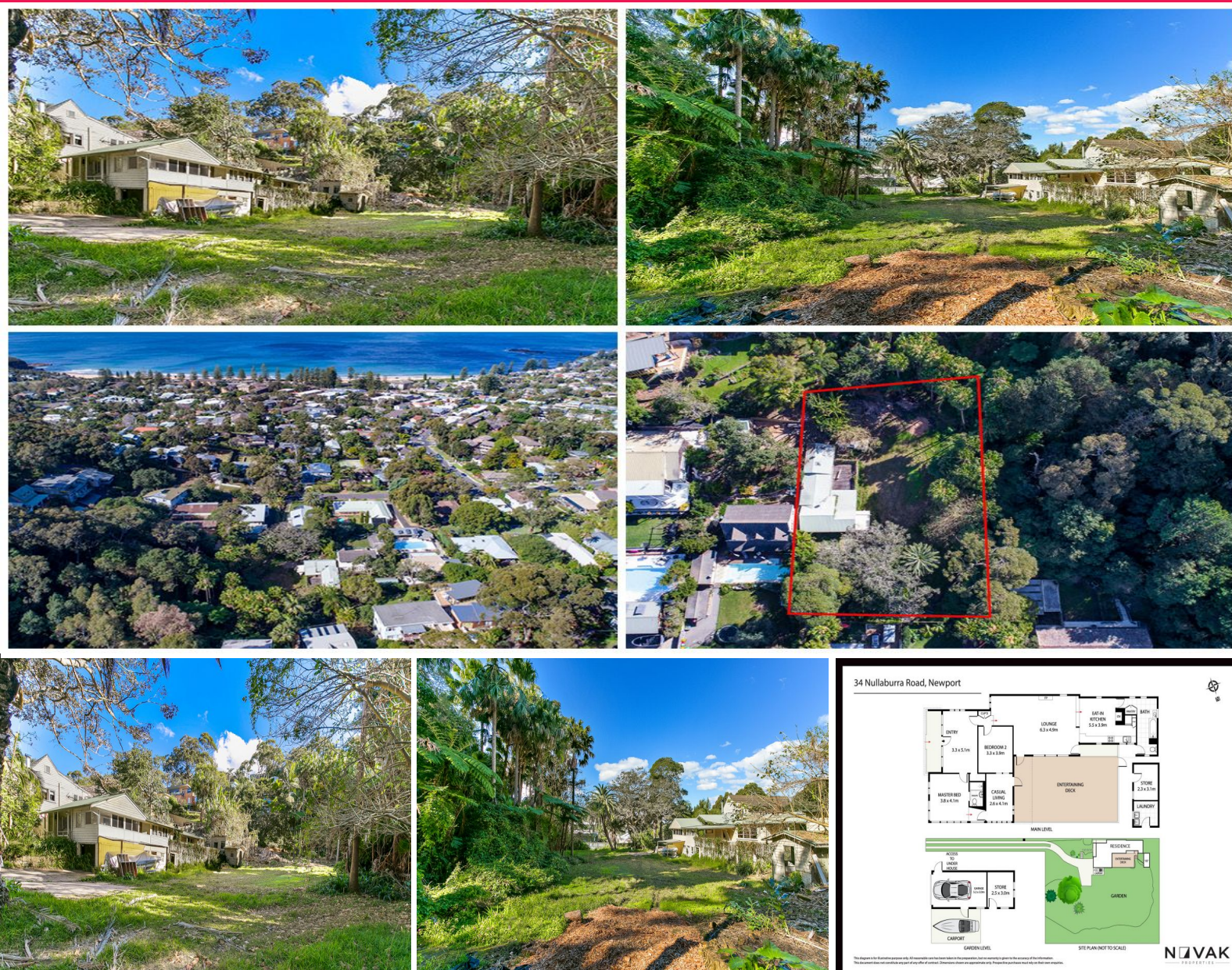
34 Nullaburra Road, Newport