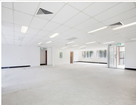
Level 1, 30 Gibbs Street, MIRANDA